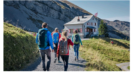
Hike Klewenalp-Brisenhaus