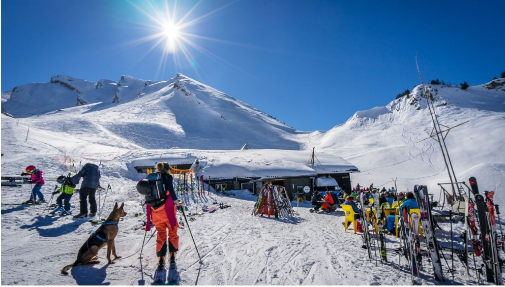
Ski tour_Klewenalp