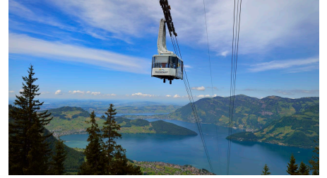
Beckenried-Klewenalp aerial cableway