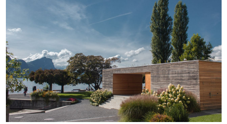
Kurpark with pavilion