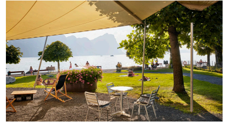
Kurpark Vitznau