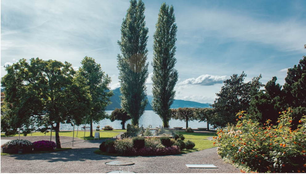
Kurpark Vitznau