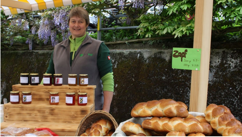
local market