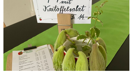
local market