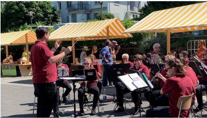
local market - © hiesige-Märt, Vitznau