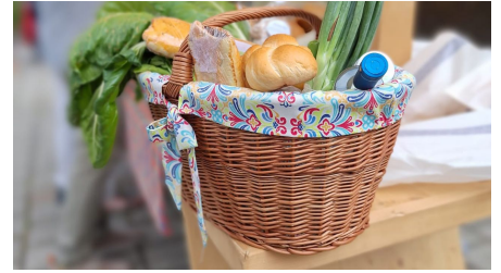
local market