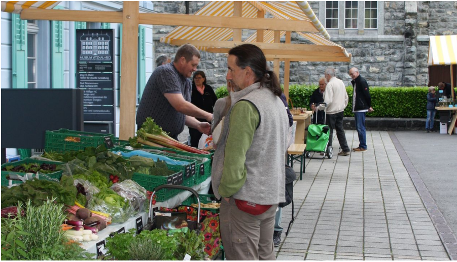
local market