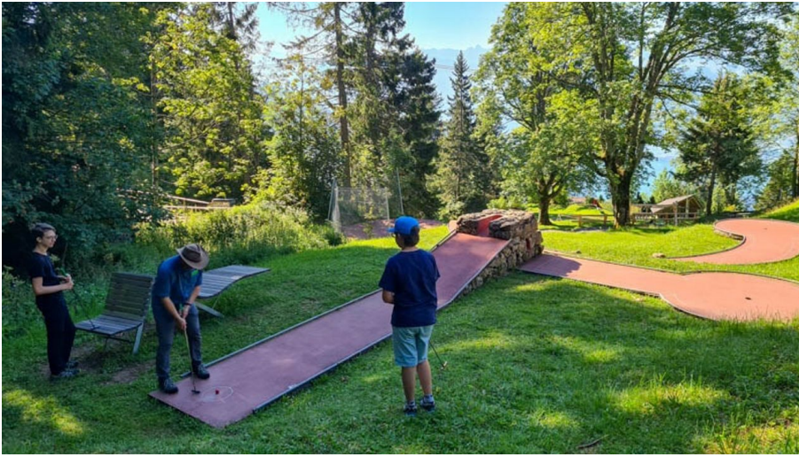
Schwyz Tourismus, A#cht Schwyz