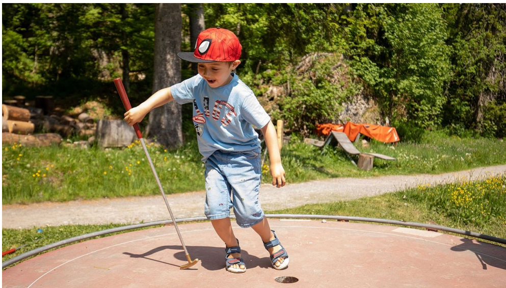
Minigolf auf Rigi Kaltbad