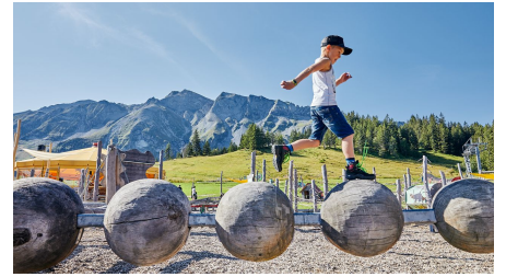
Erlebnisspielplatz Mooraculum