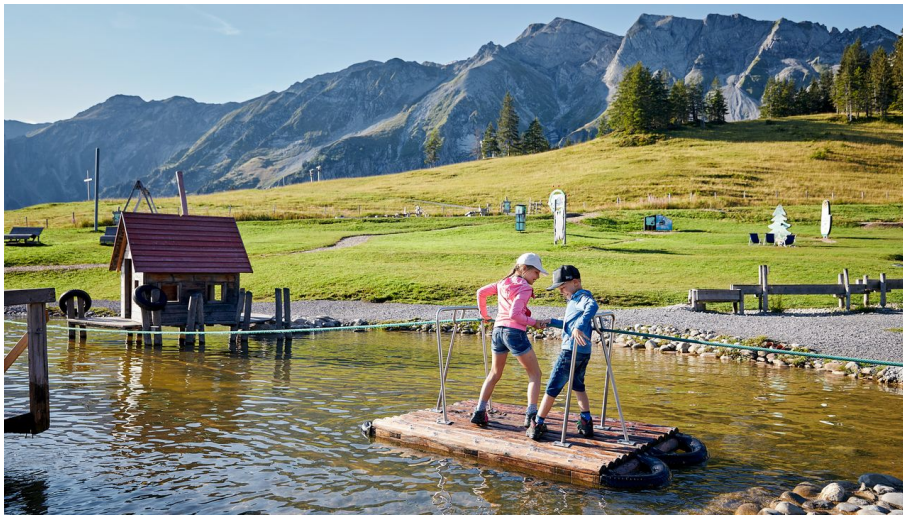
Wasserspielplatz Mooraculum

Nature Park Fireplace Picnic area Playground