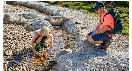
Wasserspielplatz Mooraculum