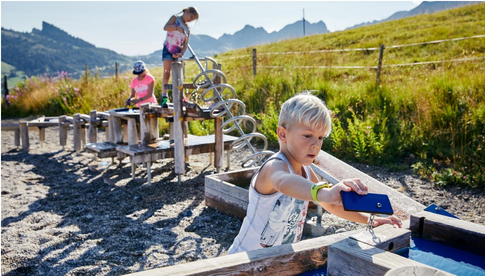
Wasserspielplatz Mooraculum