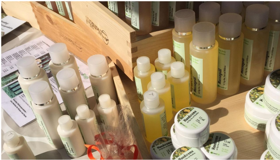
NatuRigi - mountain hay products - © NatuRigi