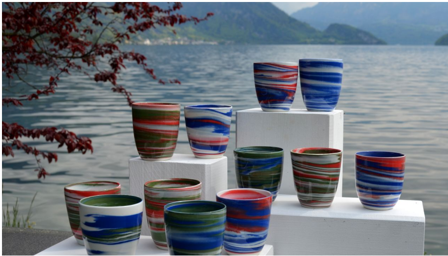
Pottery by the lake - © Töpferei am See