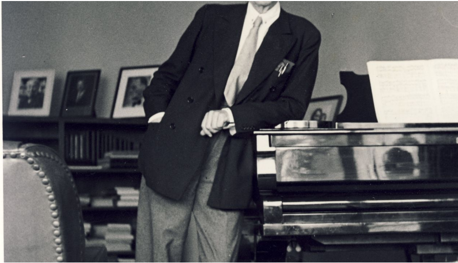
Sergei Rachmaninoff Weggis - © Rachmaninoff Stiftung