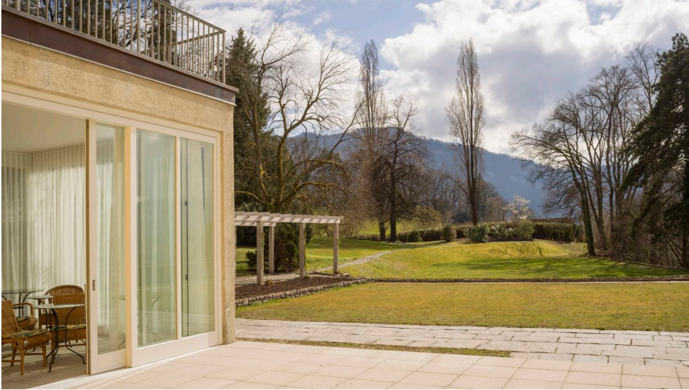
Rachmaninoff Villa Senar Weggis