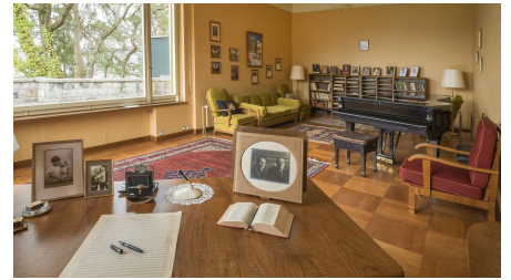
Rachmaninoff Villa Senar Weggis