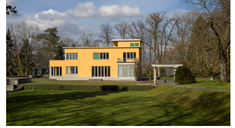
Rachmaninoff Villa Senar Weggis