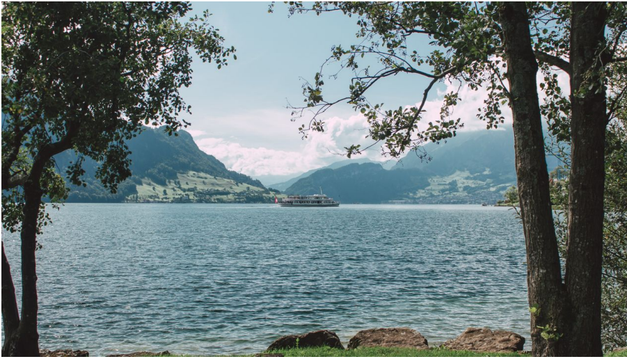
Rachmaninoff Quai