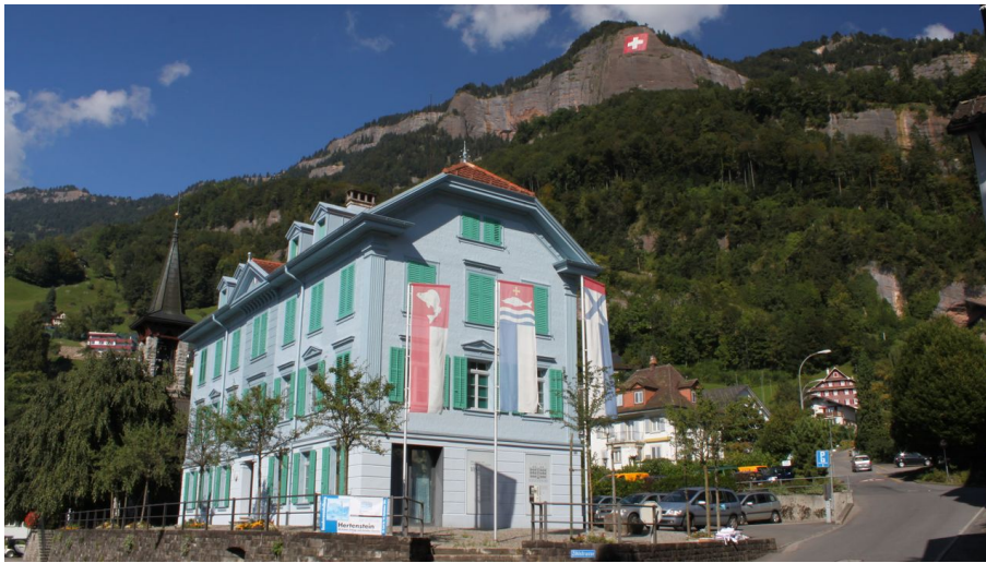
Regional museum