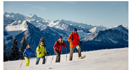
Rigi Schneeschuh Tour