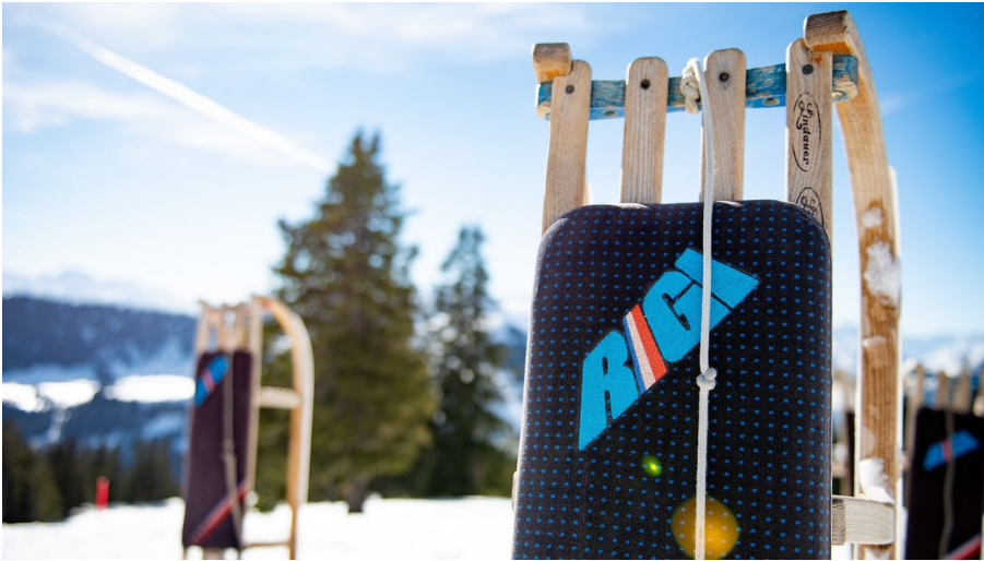
Schlitteln auf der Rigi