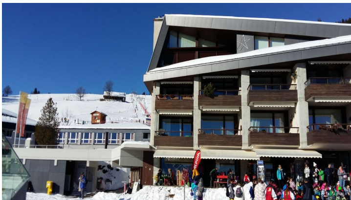
Rigi Sport Kiosk-bearb