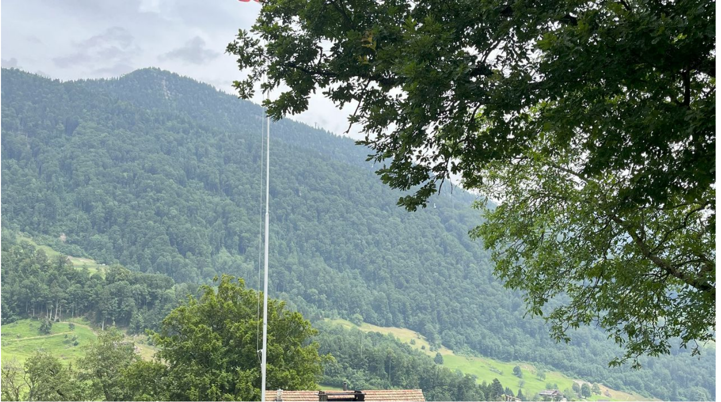
Grillstelle und Aussicht Rigiblick .jpg