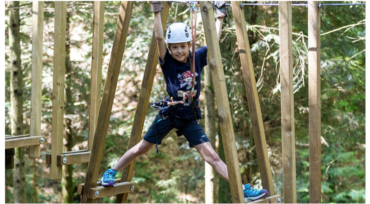
Spass im Seilpark Rigi