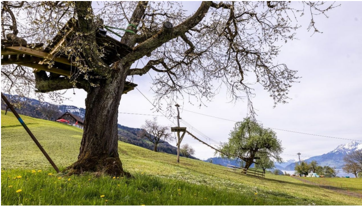
Seilpark Küssnacht am Rigi