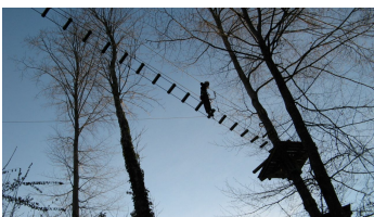
Seilpark +Ebung von unten_bearb