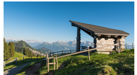
Gruebi Rotstock