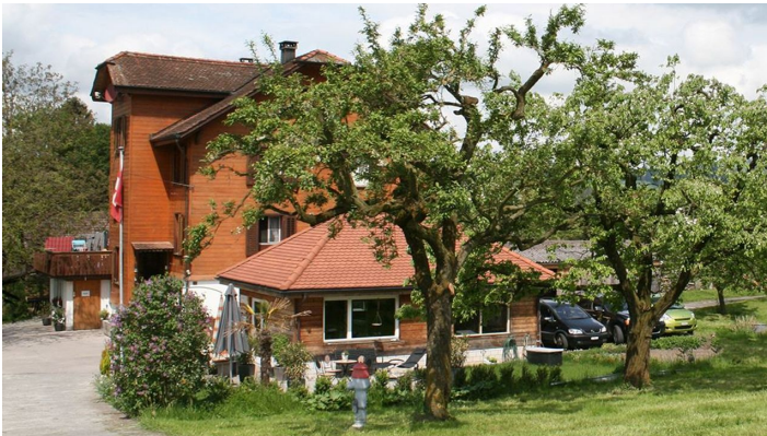
Stalder distillery - © Brennerei Stalder

Opening hours farm shop Monday - Saturday from 8:00 to 19:00 Visits to the distillery by appointment only.