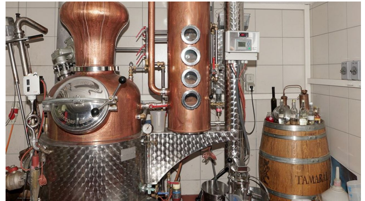
Stalder distillery