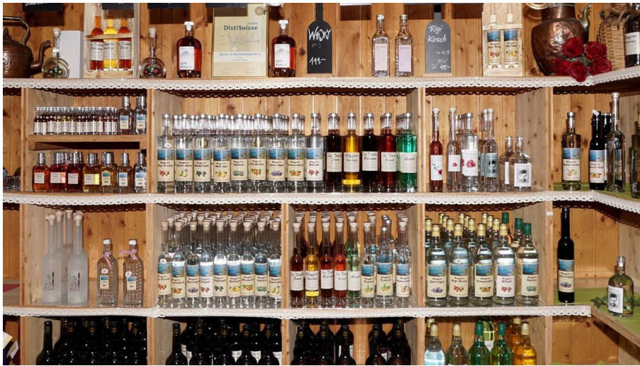
Stalder distillery farm shop