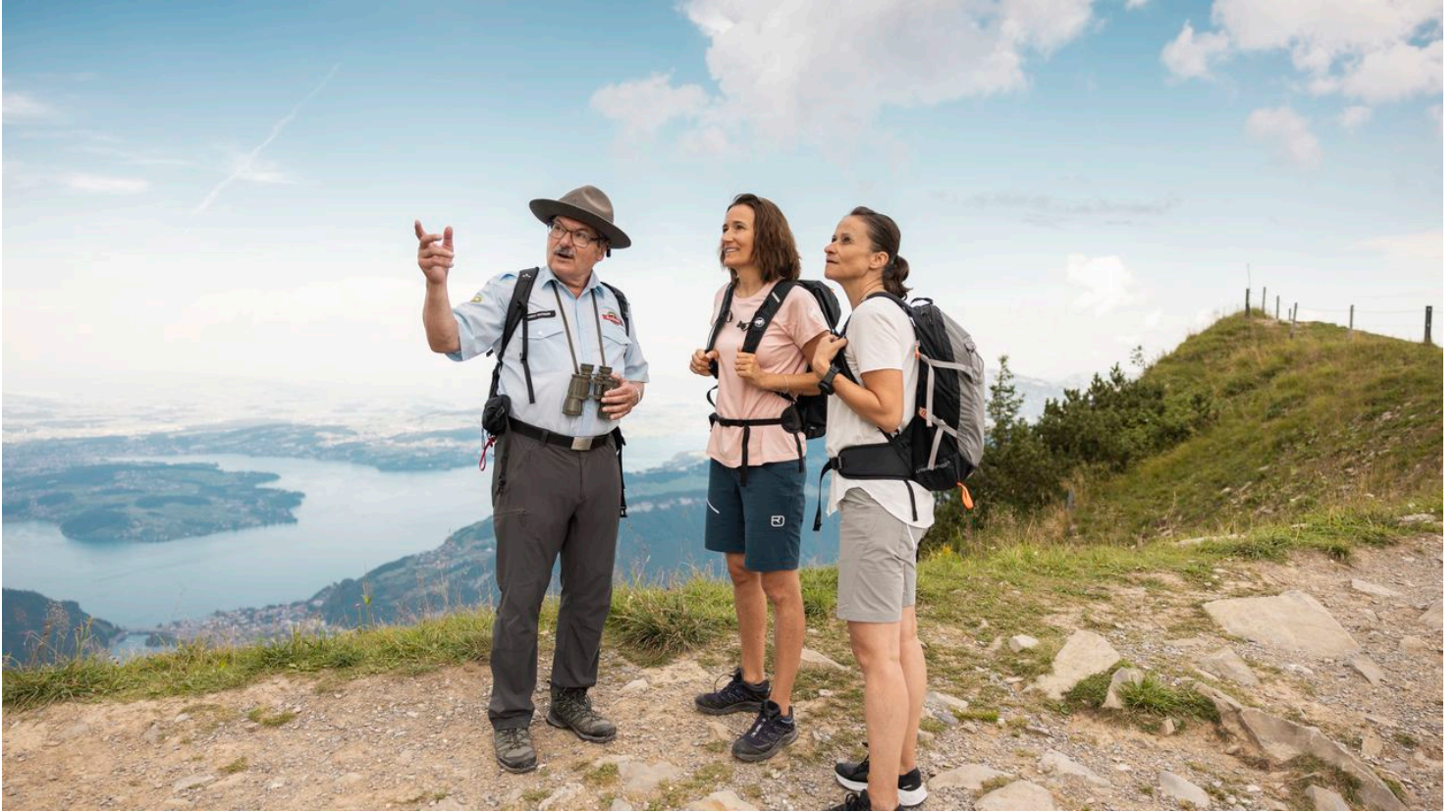
Stanserhorn Ranger