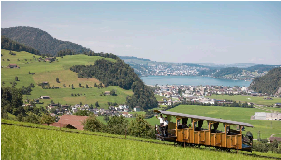
Stanserhorn funicular railway