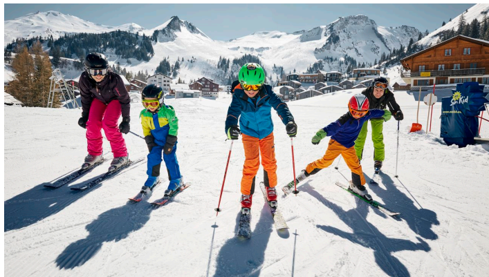
Stoos-Fronalpstock winter skiing - © Luzern Tourismus, Beat Brechbühl