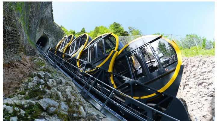
Schwyz Stoos funicular railway