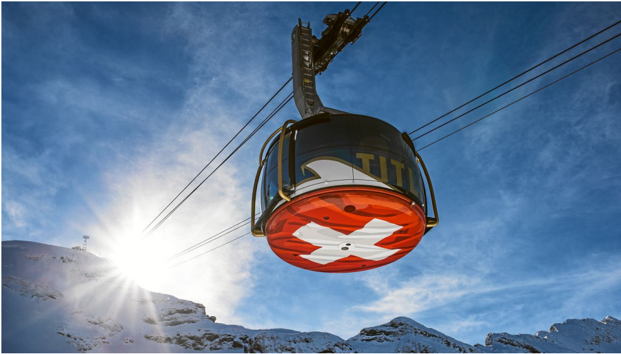
Titlis Rotair