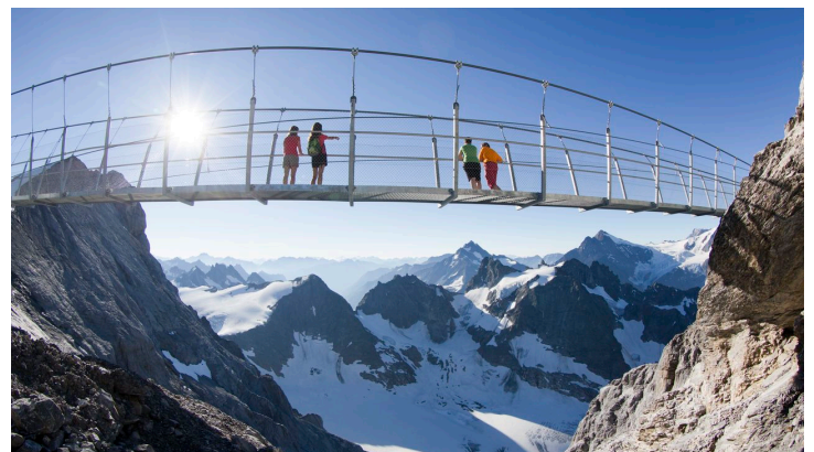
Titlis Cliff Walk