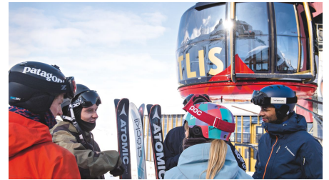
Titlis Engelberg Skiing