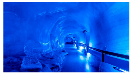
Titlis Glacier Grotto