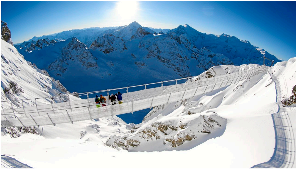
Titlis Cliff Walk