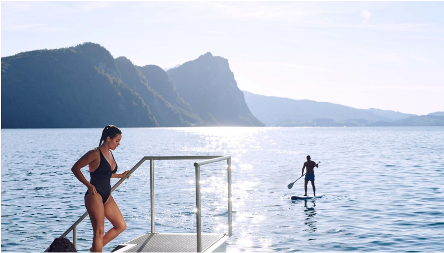
Vitznauerhof swimming in Lake Lucerne - © Hotel Vitznauerhof