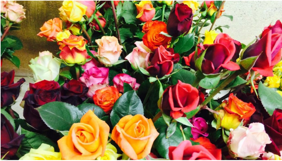
Weggis roses