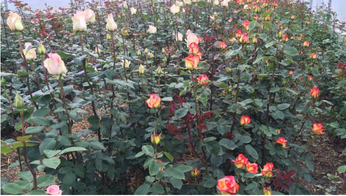
Weggis roses - © Weggiser Rosen