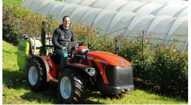
Weggis roses