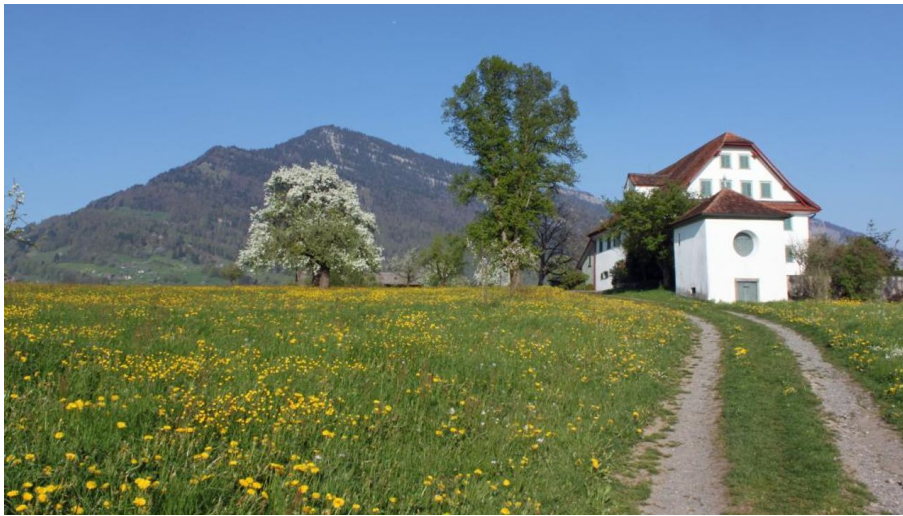
Brünnhof Weggis - © Tourist Information Weggis (Luzern Tourismus AG), Tourist Information Weggis