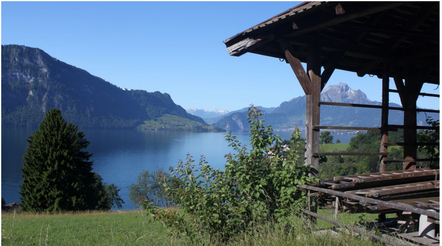
Aussicht auf Pilatus und Vierwaldstättersee

In the Unterdorf, the All Saints Chapel with its frescoes is worth a visit.