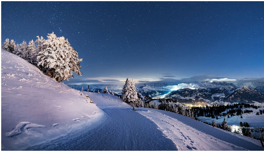
Die Rigi bei Nacht