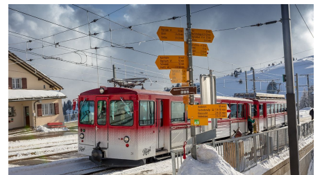
Rigi Staffel