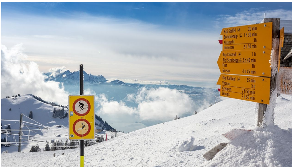
Rigi Kulm