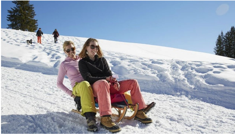
Gäste-Service Rigi, Gäste-Service Rigi