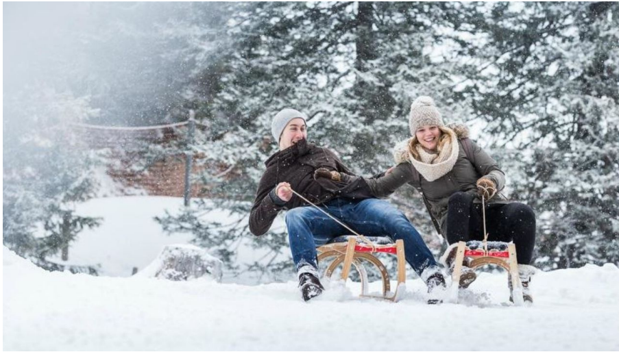
Gäste-Service Rigi, Gäste-Service Rigi