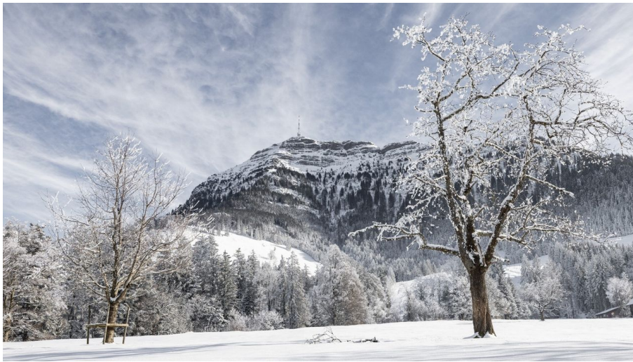
Seebodenalp im Winterkleid