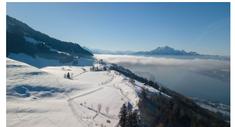
Rita Baggenstos, Gäste-Service Rigi