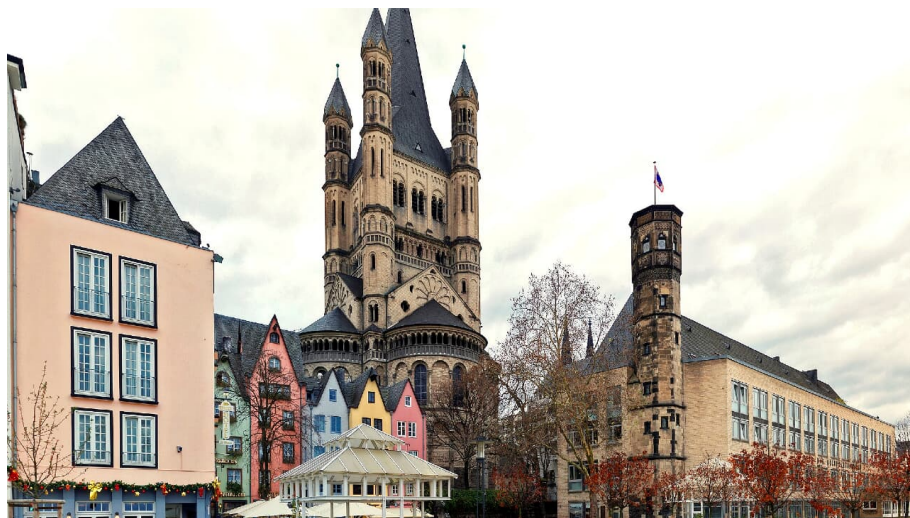
Udo Haake - Udo Haake