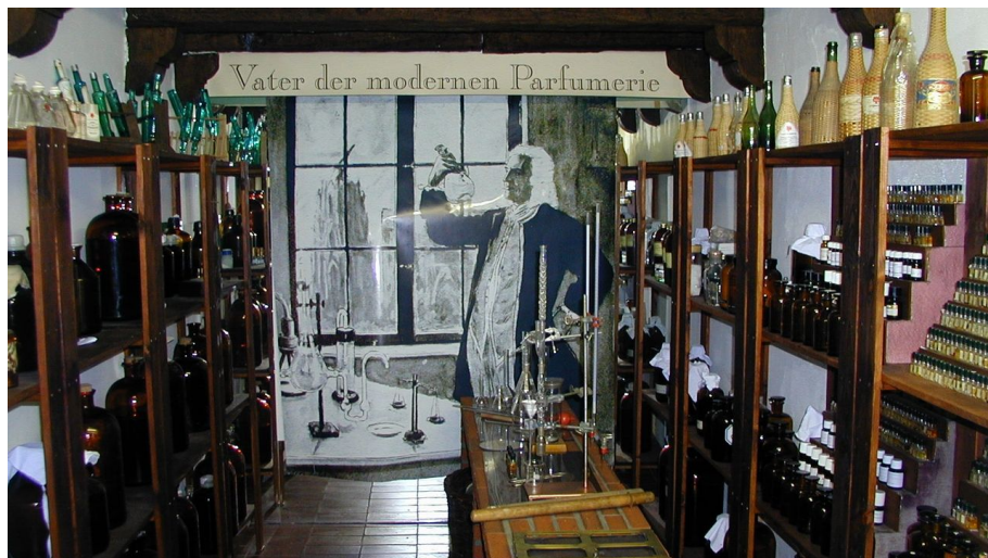
Farina - - Johann Maria Farina