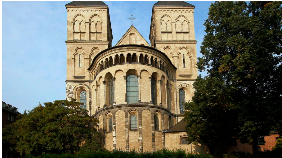
St. Kunibert