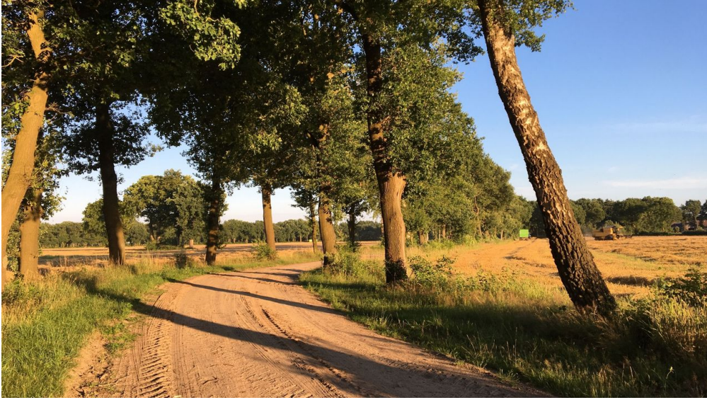
Ammerland Touristik, Ostfriesland Tourismus