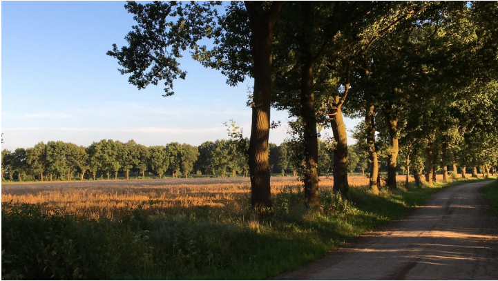
Ammerland Touristik, Ostfriesland Tourismus