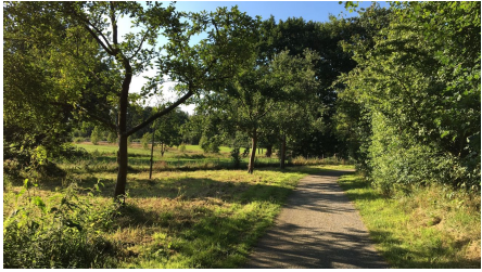
Ammerland Touristik, Ostfriesland Tourismus