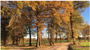
Marlis Puls, Ostfriesland Tourismus