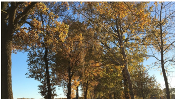
Marlis Puls, Ostfriesland Tourismus