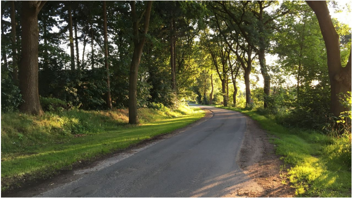
Ammerland Touristik, Ostfriesland Tourismus