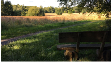
Ammerland Touristik, Ostfriesland Tourismus