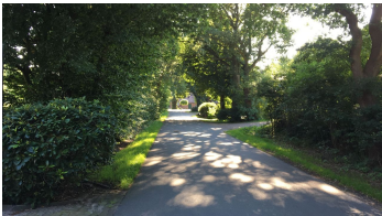
Ammerland Touristik, Ostfriesland Tourismus