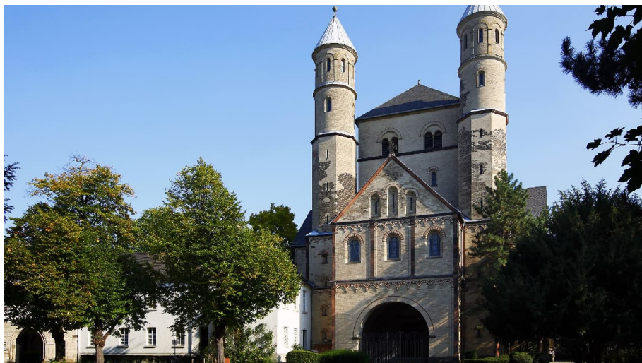
Udo Haake - Udo Haake