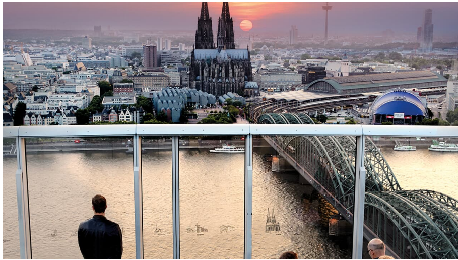
Axel Schulten - Axel Schulten