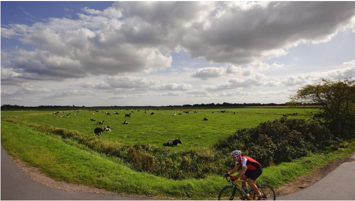
Ammerland Touristik, Ostfriesland Tourismus

ID: 90874F8E41952903A26ED24B8E00FE88 Last changed on 23.01.2024, 09:44