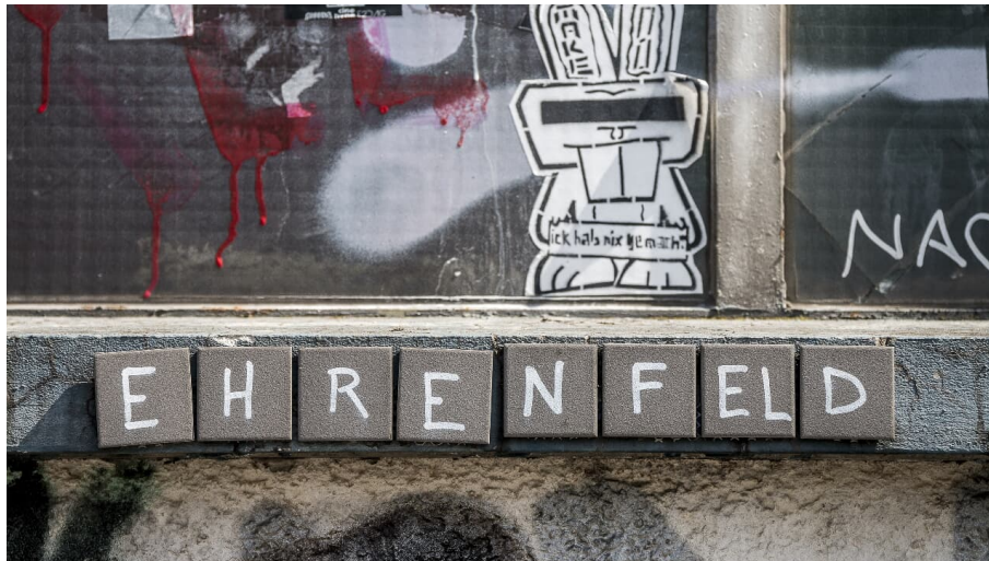
Bilderblitz - Bilderblitz