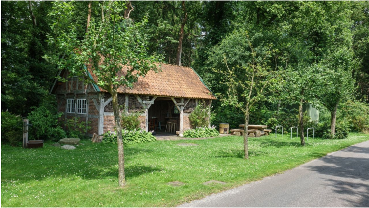
Ammerland Touristik, Ostfriesland Tourismus