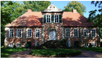
Schloss Fikensolt