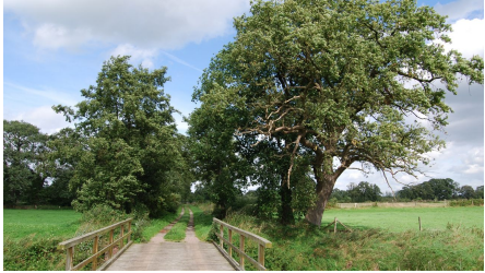
Ammerland Touristik, Ostfriesland Tourismus