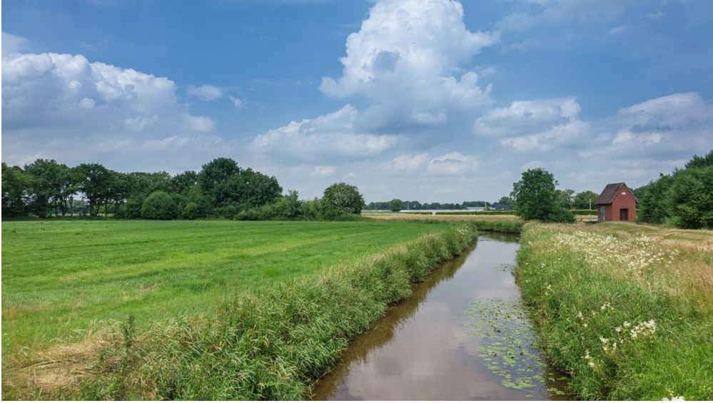
Ammerland Touristik, Ostfriesland Tourismus