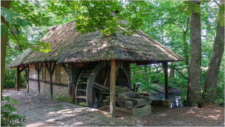
Ammerland Touristik, Ostfriesland Tourismus