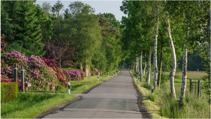
Ammerland Touristik, Ostfriesland Tourismus