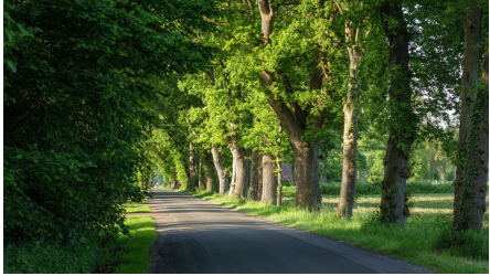
Ammerland Touristik, Ostfriesland Tourismus