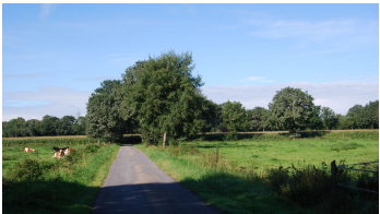
Wallheckenroute - Streckenabschnitt