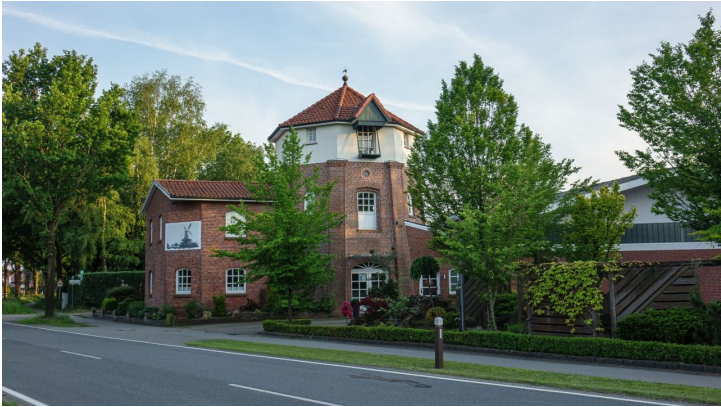
Ammerland Touristik, Ostfriesland Tourismus