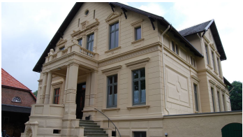
Gut Barghorn