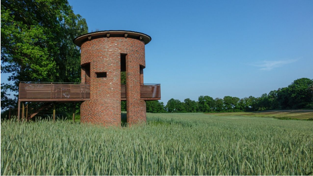
Ammerland Touristik, Ostfriesland Tourismus