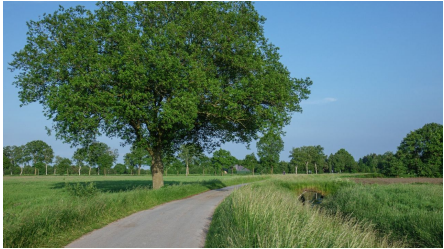
Ammerland Touristik, Ostfriesland Tourismus