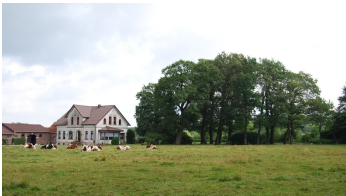
Wallheckenroute - Streckenabschnitt