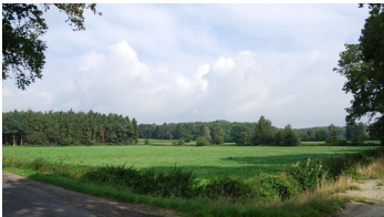
Wallheckenroute - Streckenabschnitt