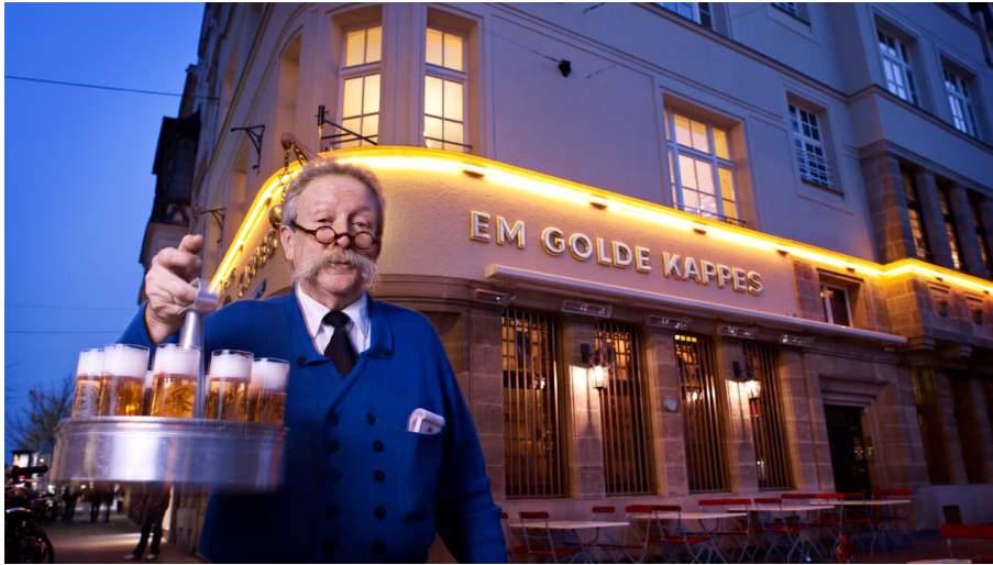
Cölner Hofbräu Früh