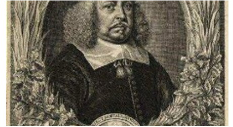
Landesgeschichtliche Sammlung, Joachim von Sandrart, 1606-1688 (Künstler)