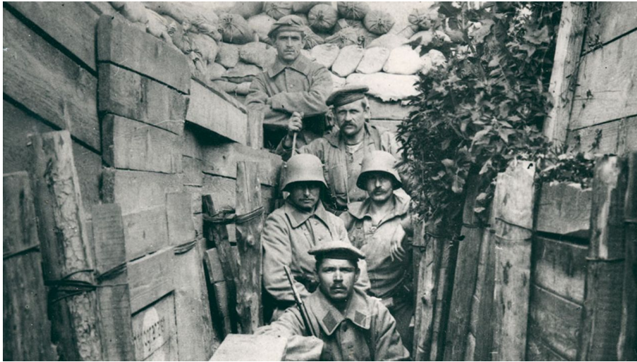
Skyttegrav ved Lombardzite i Flandern i 1916.