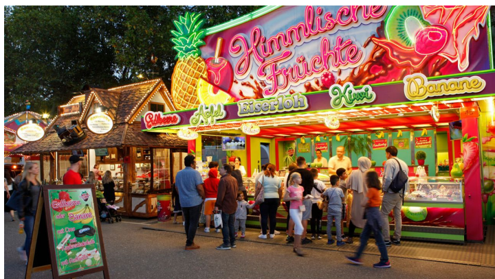
Wäldchestag MG 2120 visitfrankfurt Goesta A C Ruehl