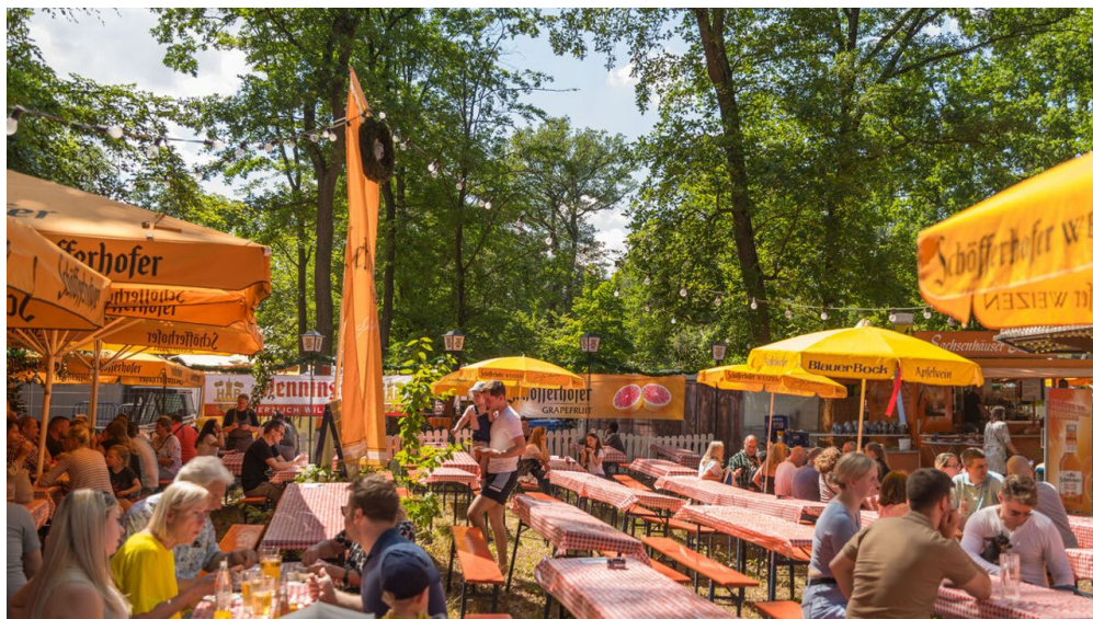
Wäldchestag Frankfurt DSC 3016 visitfrankfurt Holger Ullmann - © #visitfrankfurt, Holger Ullmann