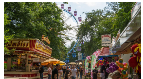
Wäldchestag Frankfurt DSC 2976 visitfrankfurt Holger Ullmann - © #visitfrankfurt, Holger Ullmann