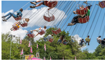
Waldchestag Kettenkarussell DSC 2864 visitfrankfurt Holger Ullmann 1