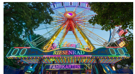
Wäldchestag Frankfurt Riesenrad DSC 3886 visitfrankfurt Holger Ullmann