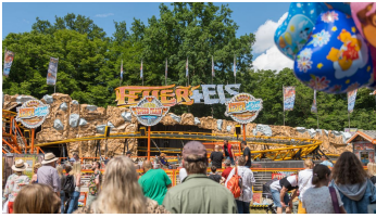
Waldchestag Frankfurt DSC 2873 visitfrankfurt Holger Ullmann - © #visitfrankfurt, Holger Ullmann