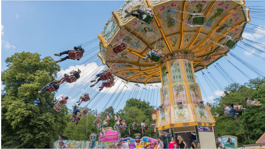
Wäldchestag Frankfurt Kettenkarussell DSC 3140 visitfrankfurt Holger Ullmann - © #visitfrankfurt, Holger Ullmann