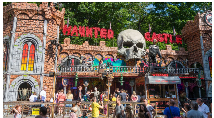
Wäldchestag Frankfurt Geisterbahn DSC 3652 visitfrankfurt Holger Ullmann - © #visitfrankfurt, Holger Ullmann