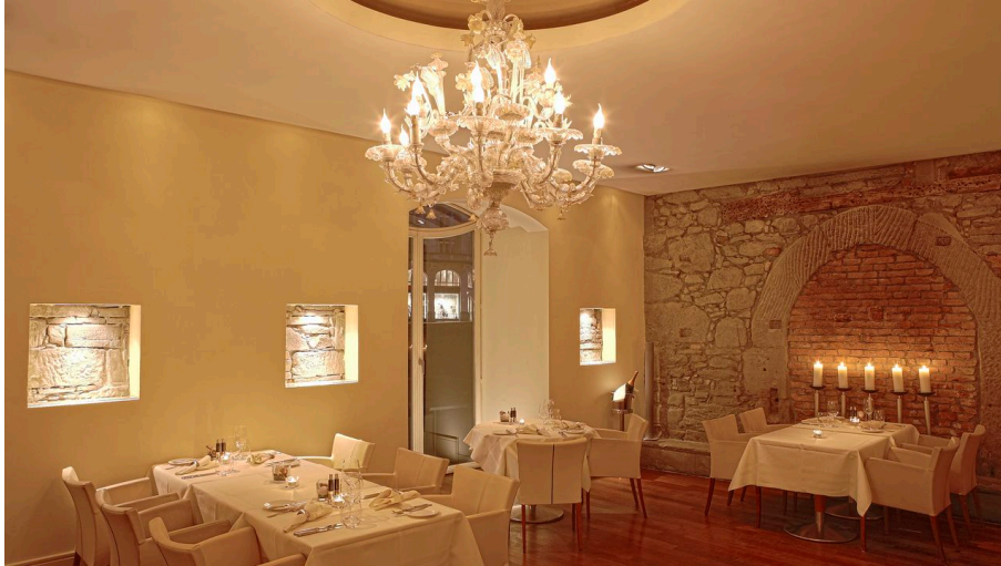
Oliver Stern, Luzern Tourismus