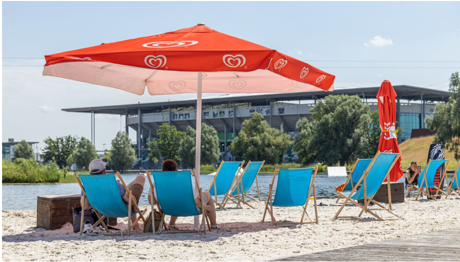
WMG Wolfsburg