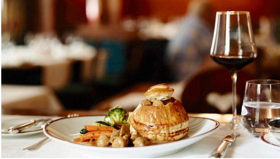
Hotel Wilden Mann Luzern, Luzern Tourismus