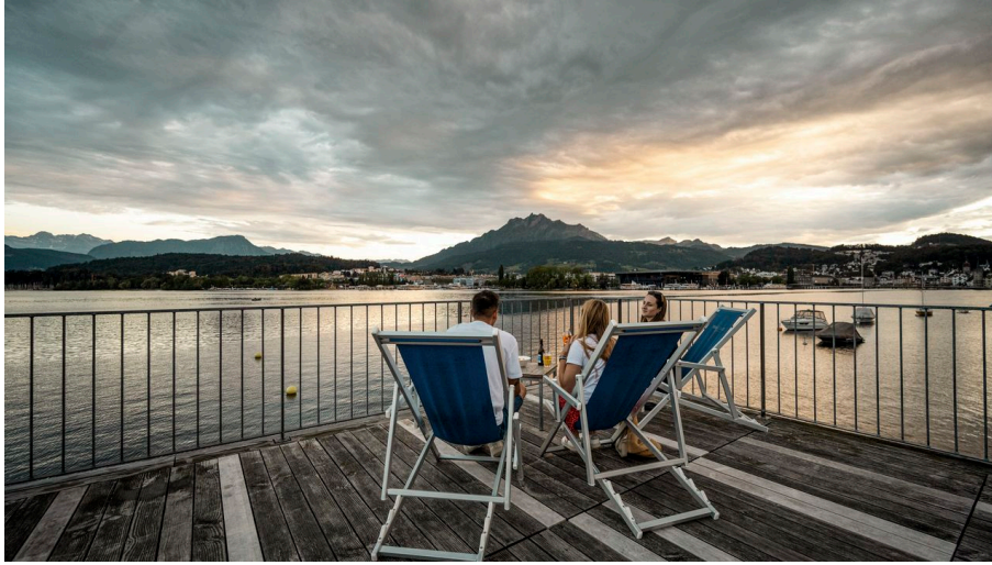
Seebad Lucerne