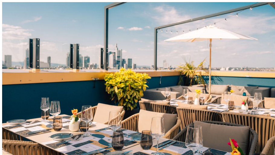
Frankfurt Blasky Rooftop 03 Melina Leibbrand 1