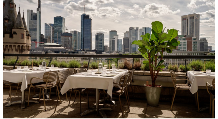
Flemings Hotels Occhio d'Oro Draußen Dachterasse