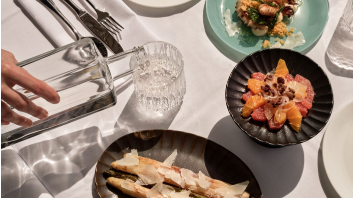
Flemings Hotels Occhio d'Oro Dachterasse Speisen