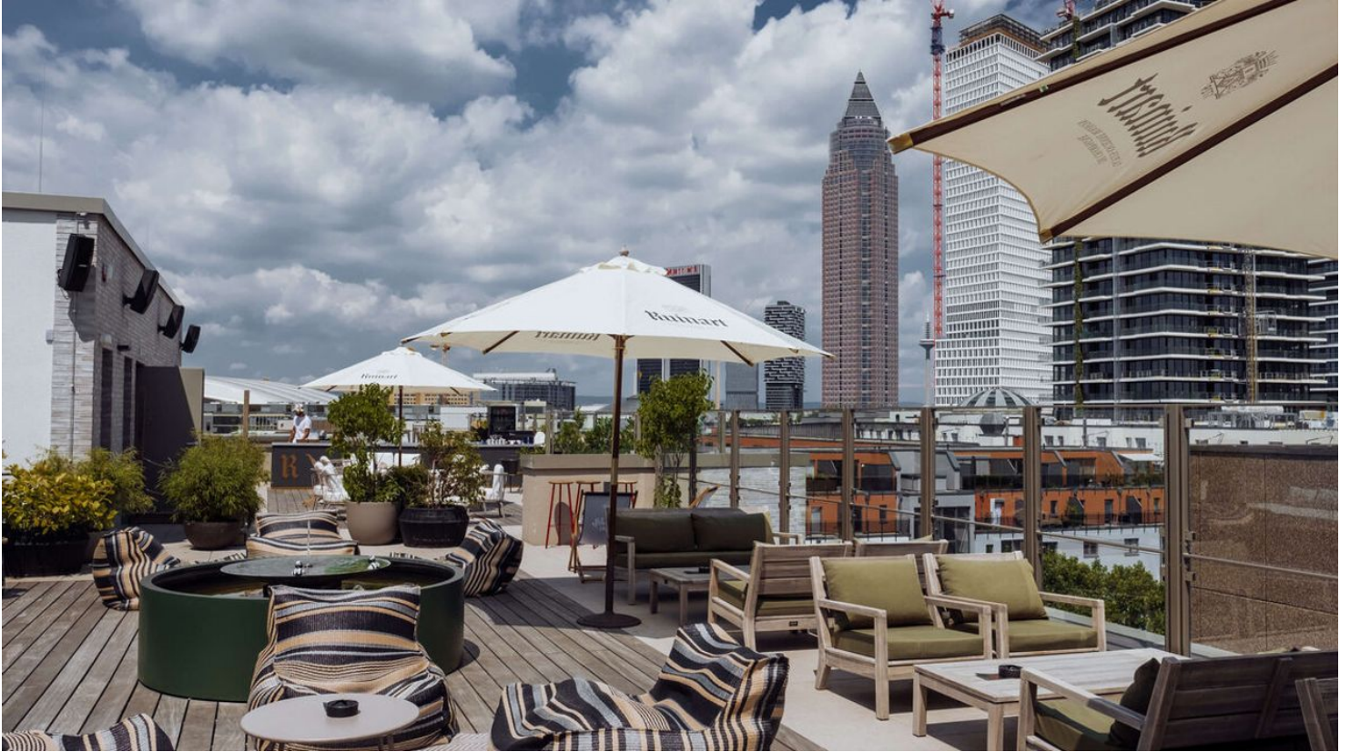
Chicago Williams rooftop