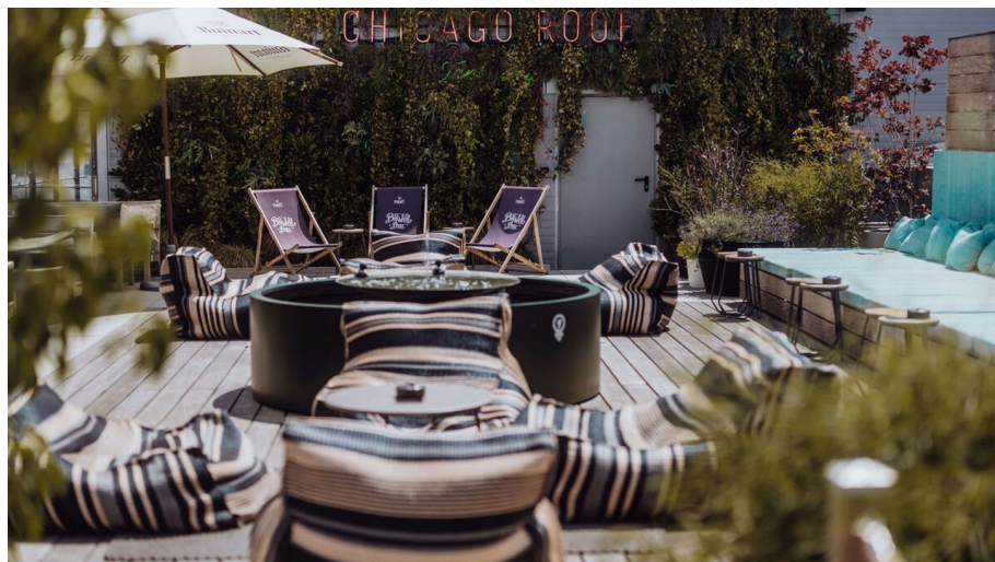
Chicago Williams rooftop