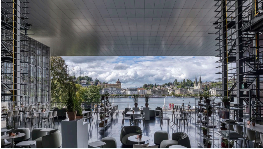
Summer Lounge at the KKL