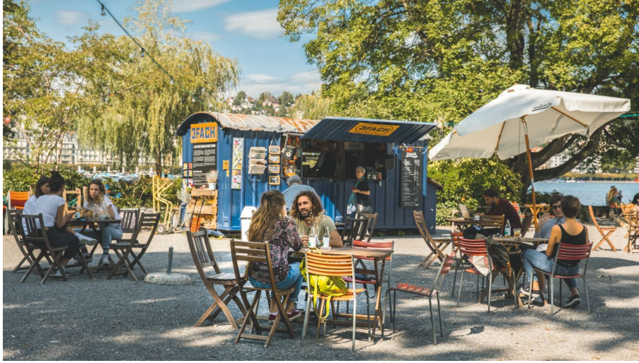
Summer at the Volière Lucerne - © Switzerland Tourism/Stefan Tschumi