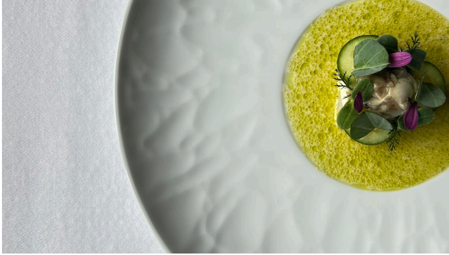
Trout Maihöfli